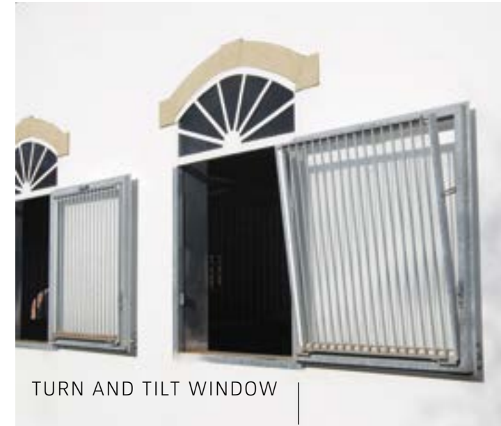
TURN AND TILT WINDOW

A tilt wing integrated into a turn window offers a sufficient supply of fresh air during the winter months as well.